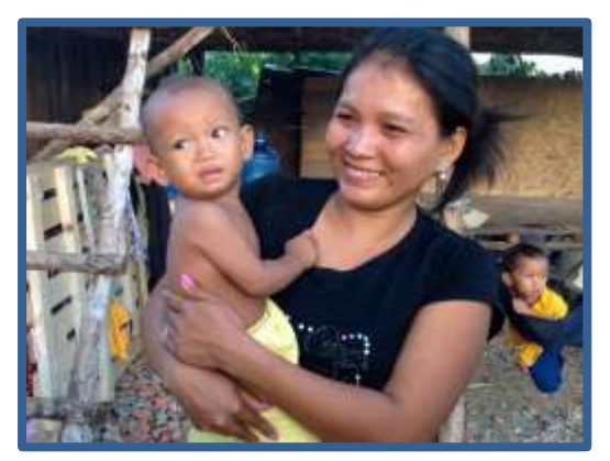
Healthy Mother and Baby - Beneficiaries of the Maternal Care Program

In the health education sphere, collaboration with Cambodian Children's Fund has resulted in the development of a best practice project working to overcome maternal and infant rates in the Steung Meanchey district of Phnom Penh, home of the infamous "Smokey Mountain" dumpsite.