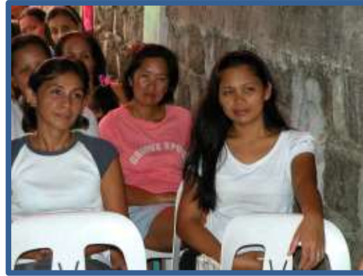
Beneficiaries of the Microfinance Business School Project attending Small Business Training

These Social Businesses provide valuable training, up-skilling and employment to the poor whilst also producing meaningful products and services. They also provide a "rich and engaging" alternative to traditional one-off philanthropic gifts.