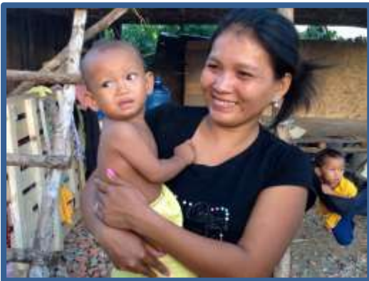
Healthy Mother and Baby - Beneficiaries of the Maternal Care Program

In the health education sphere, collaboration with Cambodian Children's Fund has resulted in the development of a best practice project working to overcome maternal and infant rates in the Steung Meanchey district of Phnom Penh, home of the infamous "Smokey Mountain" dumpsite.